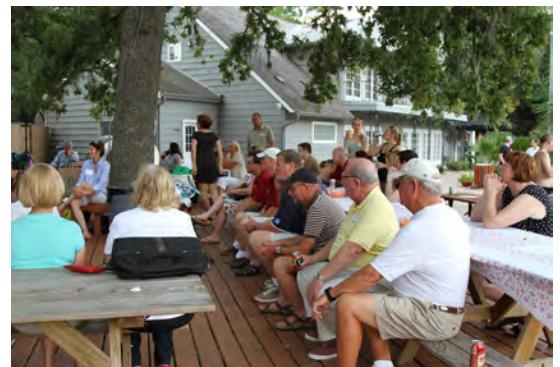
The Annual Meeting underway