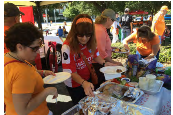
A little bit of everything