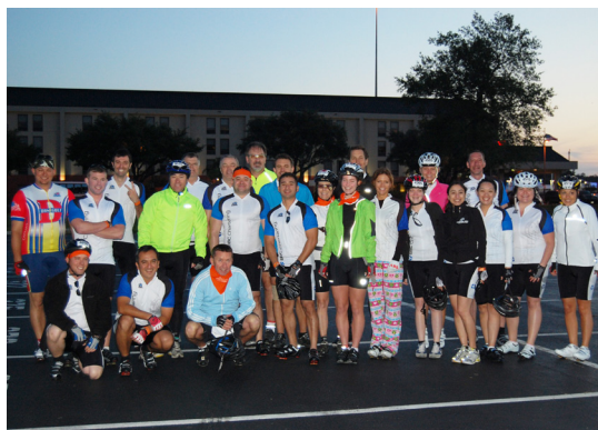
BBC Chartering Team