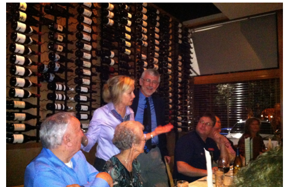
Danish Immigrant Museum Board Members Dinner at Sorrel Urban Bistro