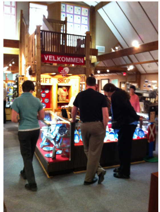
The Gift Shop at Danevang Heritage Museum