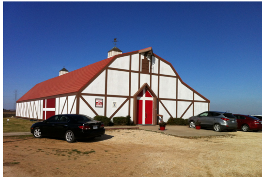
Danevang Heritage Museum