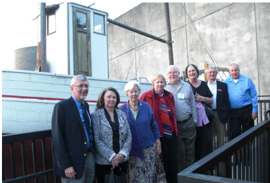
Danish Immigrant Museum Board Members visiting the Hanne Frank fishing boat at the Holocaust Museum